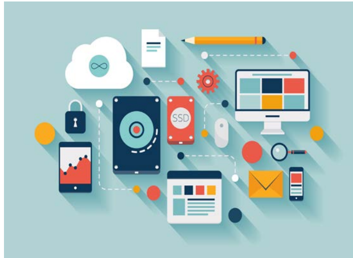
Figure 2 Archival information resources