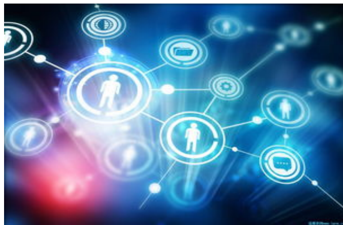
Figure 1 Archival information resources

of the enterprise file information management information seriously inadequate attention, because of such a careless attitude and led to the enterprise file information management information level seriously backward and too low, completely can not follow the pace of the development of the big data information age. Even in the eyes of some leaders and management, the construction of enterprise archives information management informatization may cause a large amount of waste of manpower, material resources and time costs, thus increasing the difficulty of financial department work [3]. There are also some leaders who focus their work on how to obtain more enterprise income, and are completely indifferent to the informationization of enterprise archives information management. Not only that, but also some enterprise leaders have always done a good job of building face project of archival information management informatization, but have never attached importance to the informationization of archival information management. Completely unaware of the importance of archival information management informatization, can not fully network information data in archival information management key role, so that "big data processing" only exists in one form. but efficiency and quality can not be mentioned.